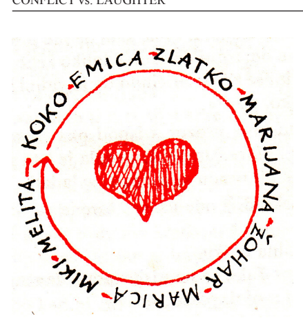
The «circle of love» as an illustration of adolescent vulnerability.

we find the characters at the threshold of adolescence involved in problems typical of adolescents, and often depicted in young adult novels, such as the many facets of their relationship with peers, whether friends or adversaries, and with romantic interests and/or partners. Consequently, childhood play and mystery-solving are transformed into the problems of falling in and out of love, unrequited love, rejection and refusal, in other words, the problems of adolescent vulnerability. However, Kušan approaches them with a particular brand of humor and irony combined with deep understanding for the problems of growing up. He illustrates the thwarted attempts of his characters at winning the hearts of their love interests with the image of a "circle of love" in which each character is in love with the next person in the circle, "You disturbed this perfect circle of love, this love wheel <...>— Look how stupid life is. We are so close, yet so far. Only one step separates us from each other, from happiness. If only the wheel turned the other way..." [p. 102–103] (Figure 4). When his attempts to win Ana, as well as his football career, hit rock bottom, Koko decides on a drastic measure — to take his own life: